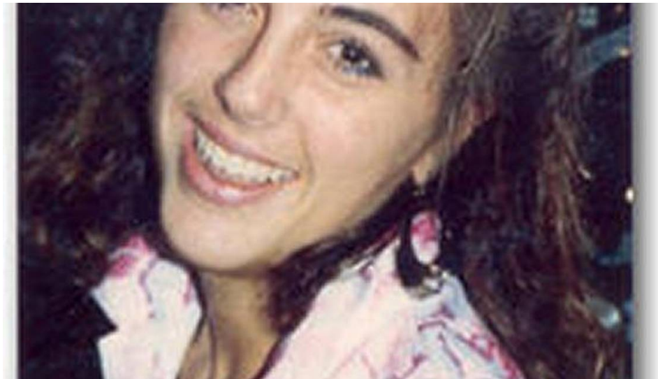
Terry Schiavo in a portrait provided by her family.