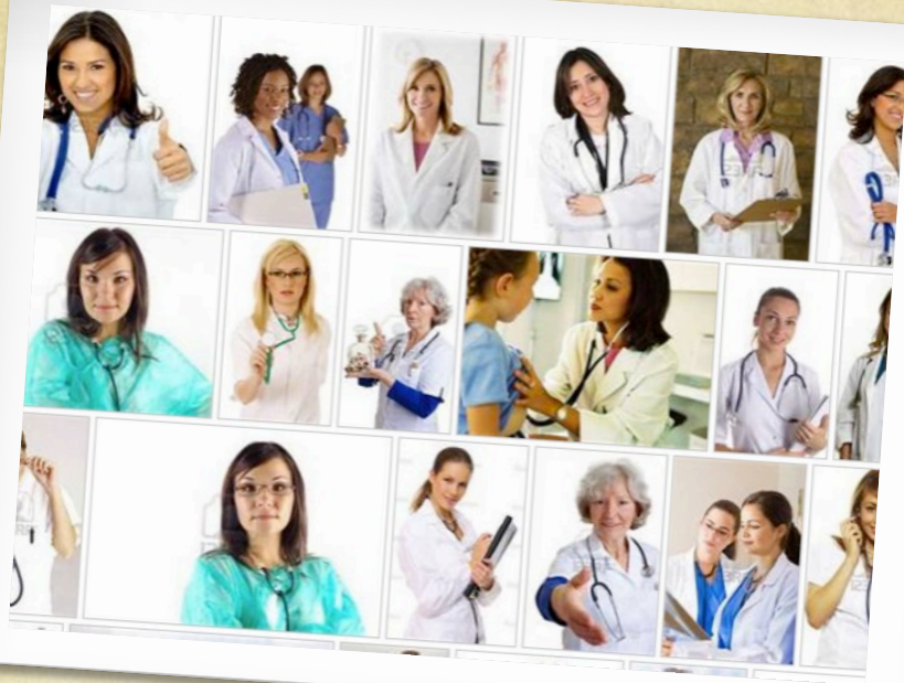
Image Search II