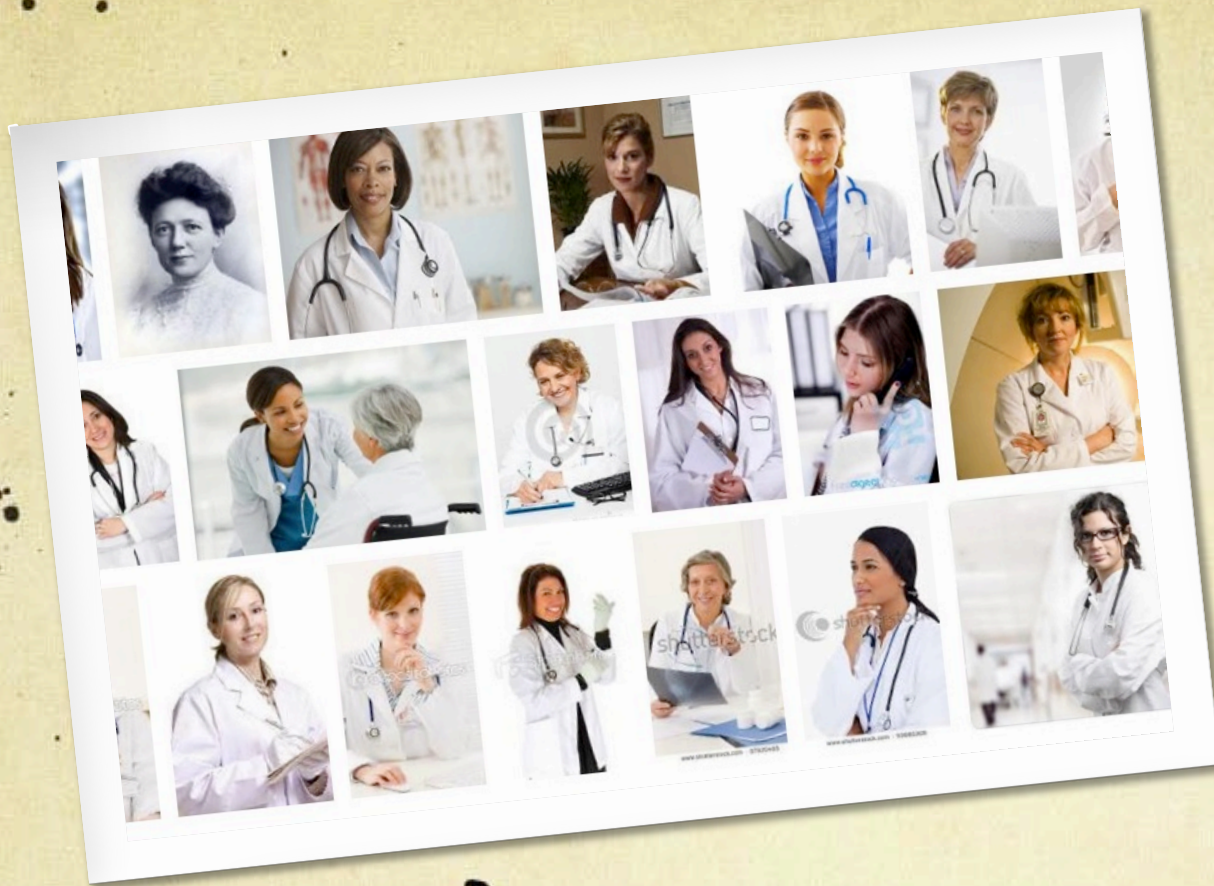
Image Search I